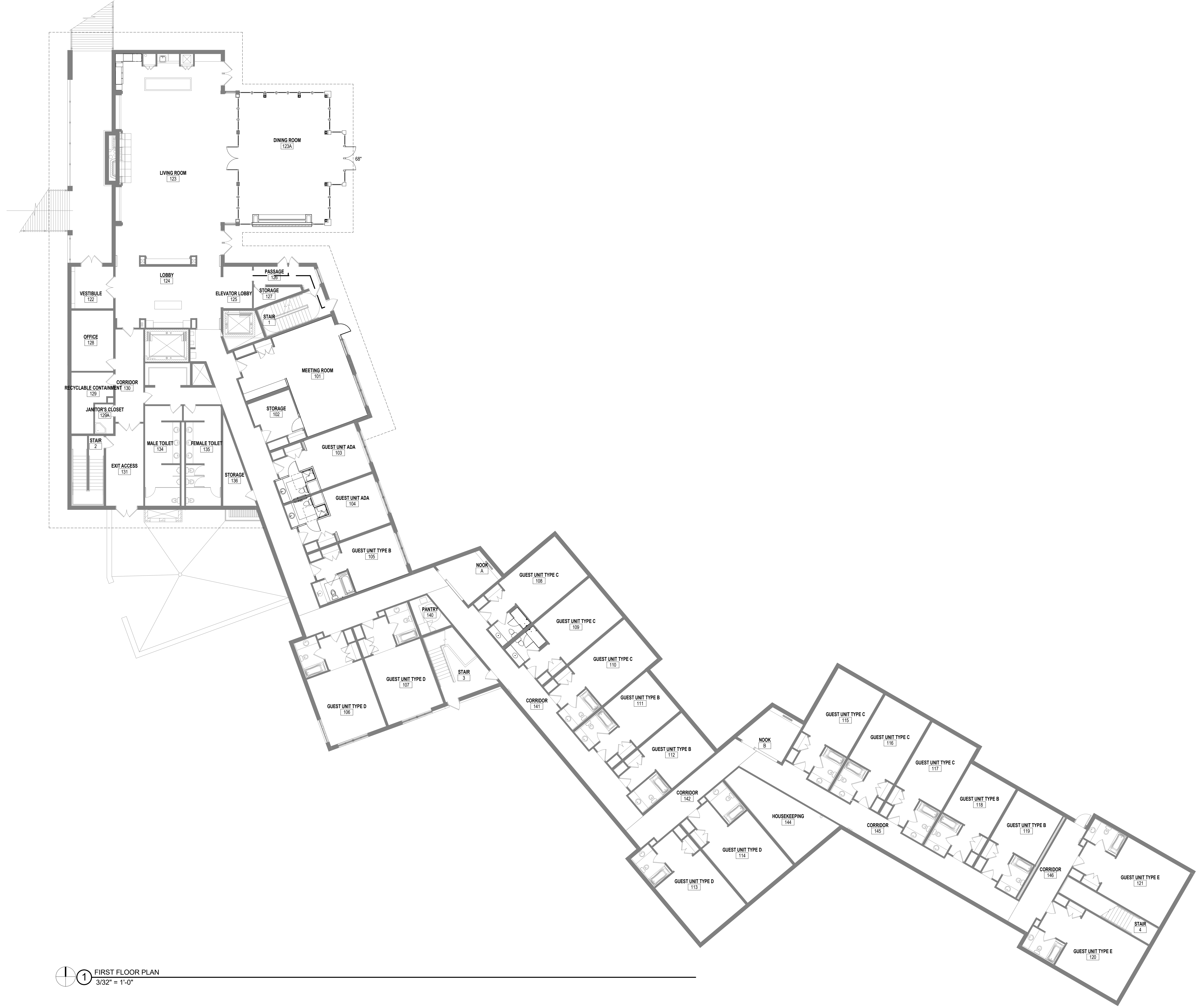
1 FIRST FLOOR PLAN 3/32" = 1'-0"